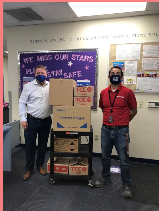
Estrella Middle School Principal