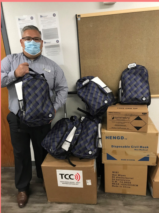
Villa de Paz Elementary School Principal