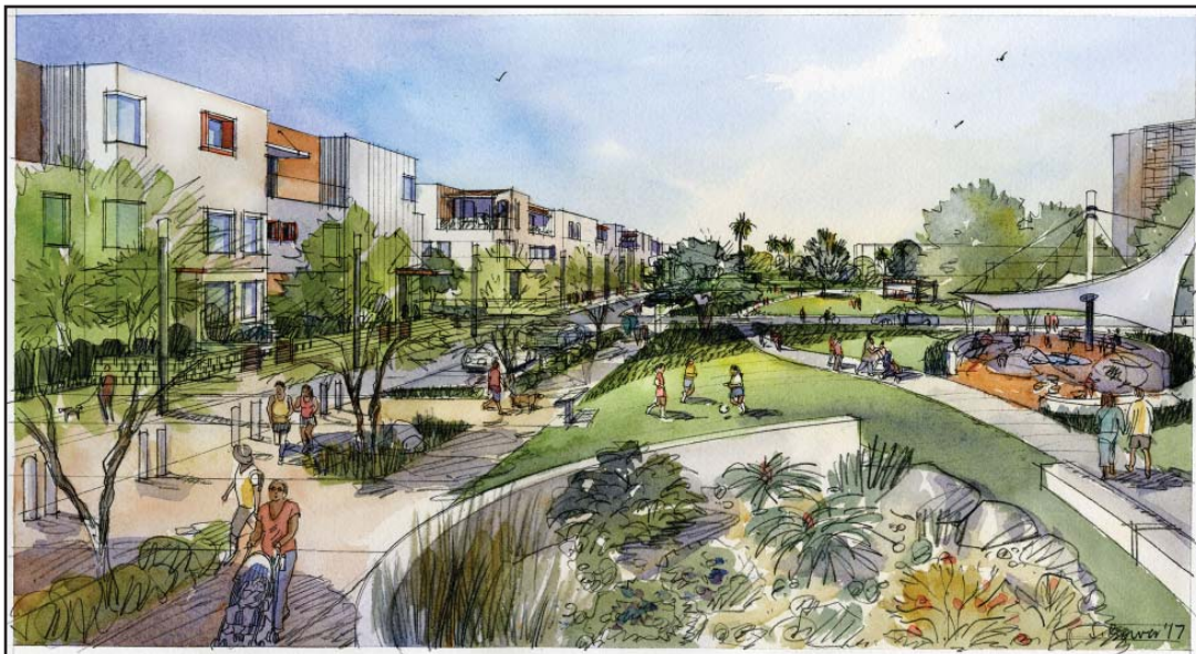
Rendering of new linear park looking south along 19th Street to establish a green spine in the neighborhood featuring walking paths, fitness stations, meditation garden, ramadas, sitting areas, trees and man-made shade structures. New homes front on to the park providing "eyes on the street" for safety.

For more information, special accommodations, or a copy of this publication in an alternative format, please call 602-261-8646.