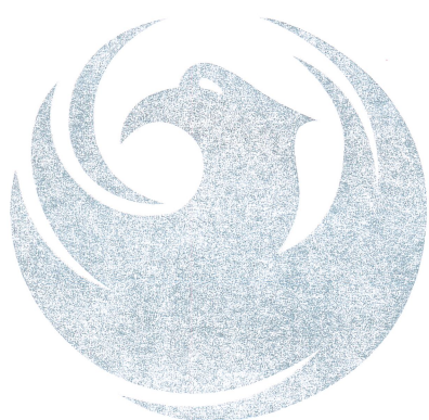
Mayor Kate Gallego City of Phoenix

in the City of Phoenix and urge all Phoenicians to join me in recognizing this important day.