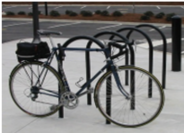
Inverted-U bicycle rack, where both ends of the "U" reach the ground.