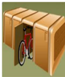
Secured bicycle parking can be accomplished through the use of individual lockers and/or the establishment of secured bicycle rooms.