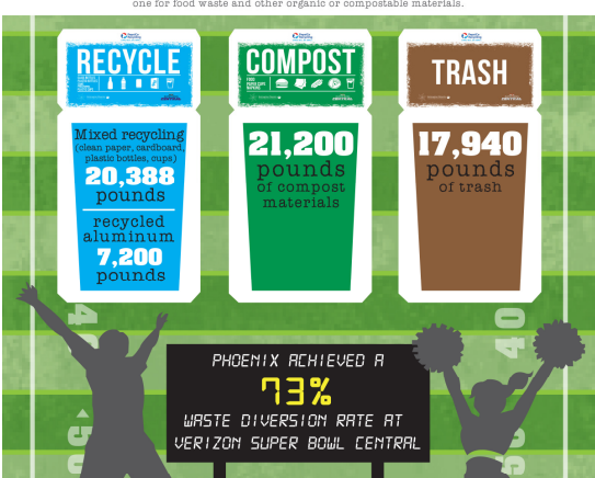
Phoenix Public Works made it convenient for attendees to sort their tra by providing clearly labeled solid waste containers that included