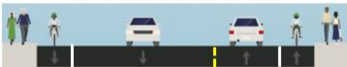
Van Buren Street to Polk Street