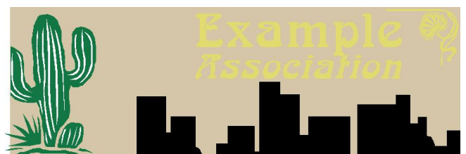
Poor choice of colors, font too small, and the artwork is distracting