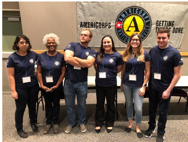
The 2018-2019 Phoenix VISTA Team