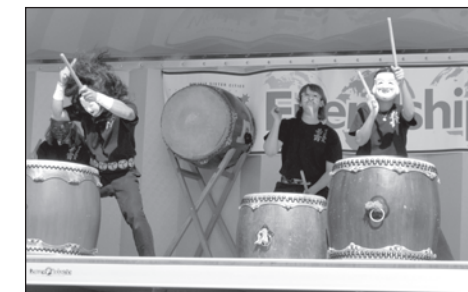
WorldFEST highlights include international entertainment and ethnic foods

For more information, visit phoenixsistercities.org or call 602-534-3751.