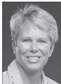
Ann Meyers Drysdale

A nn Meyers Drysdale, women's basketball pioneer, award-winning broadcaster and general manager for the Phoenix Mercury WNBA team, will deliver the keynote address at the 18th annual International Women's Day luncheon March 4.