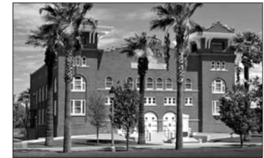
Crews have completed the renovation of Memorial Hall at Steele Indian School Park. The work included restoring the exterior of the building to its original look when it opened on the then-Phoenix Indian School campus in 1922 and modernizing the interior so that it again can be used for events. The facility, which seats 350, is available for plays, meetings and other public gatherings. The project was financed by city bond funds and grants. The 75-acre city park is located at Central Avenue and Indian School Road.