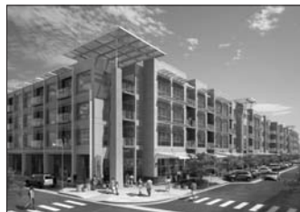
High Street, the retail phase of the CityNorth mixed-use development, opens this month near Loop 101 and 56th Street in northeast Phoenix, joining an impressive lineup of major shopping venues located throughout the city.

Many other Phoenix shopping venues can be found at phoenix.gov/shopphoenix.