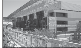
The completion of the Phoenix Convention Center's North Building ends a five-year expansion and renovation project that tripled the size of the convention facility.

The North and West buildings, which are connected by underground passages and a