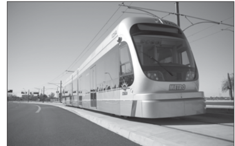
It's coming METRO light rail begins operating this month. Full coverage of the opening of the rail service as well as the grand opening of the Phoenix Convention Center's new North Building can be found inside.

Please help us make sure such senseless tragedies don't happen again. Don't use a gun to celebrate the New Year and if you hear or witness random gunfire, call 911.