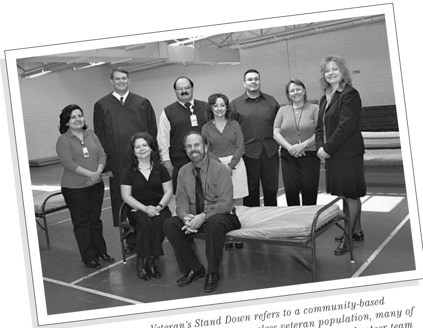
In Phoenix, the term Veteran's Stand Down refers to a community-based intervention program to help the city's homeless veteran population, many of whom suffer from post-traumatic stress disorder. This year, a volunteer team from Phoenix Municipal Court provided veterans with legal assistance, helped them resolve pending misdemeanor charges, and in some cases, had criminal arrest warrants quashed. The unresolved legal problems meant veterans couldn't take advantage of social services, job training or employment opportunities.