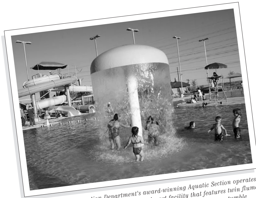
The Parks and Recreation Department's award-winning Aquatic Section operates 28 pools citywide. Pecos Pool is a state-of-the-art facility that features twin flume water slides, a zero-depth entry, separate dive well, water mushroom, tumble buckets, starburst water feature and a family changing room. The pool also features a chair lift and submersible wheelchair for people with disabilities.