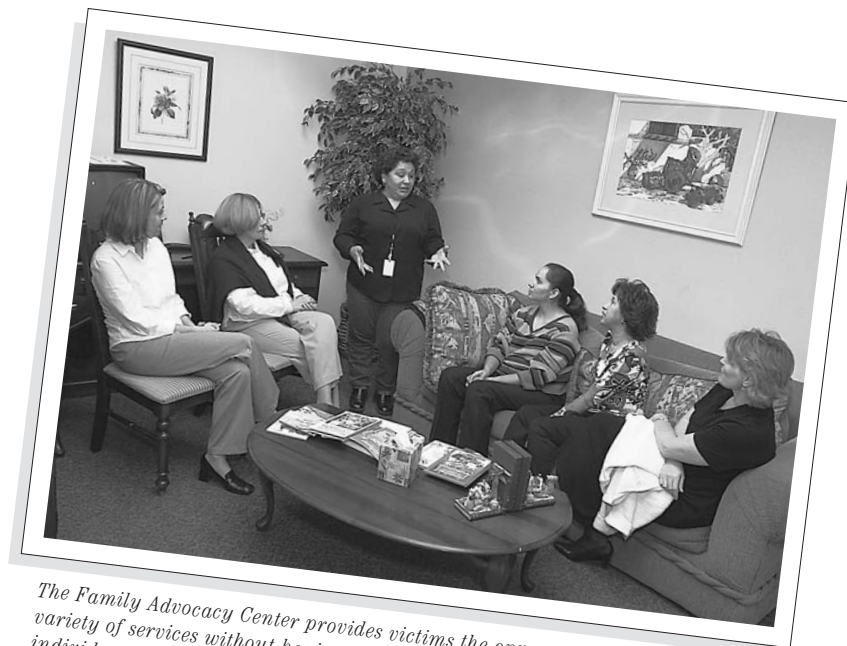
The Family Advocacy Center provides victims the opportunity to obtain a variety of services without having to travel to multiple locations. At the center, individuals are able to meet with community and human services workers, and police and prosecutor staff, including victim advocates who are available to answer questions and provide emotional support.

1 Includes shelter placements, orders of protection, financial assistance, counseling services and medical examinations.