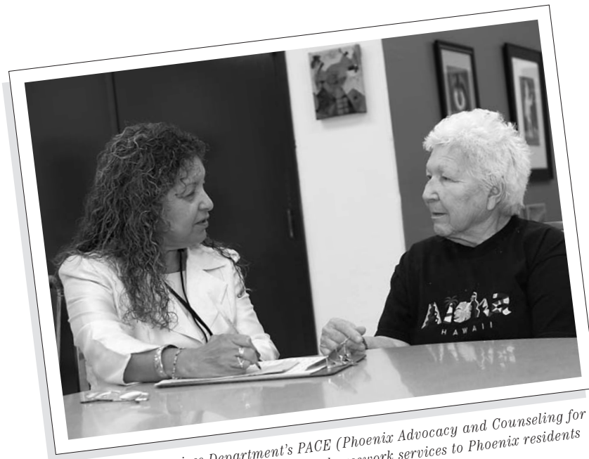
The Human Services Department's PACE (Phoenix Advocacy and Counseling for Elderly) program offers counseling and casework services to Phoenix residents over the age of 60.

The Human Services operating budget allowance of $62,336,000 is $1,896,000 or 3.0 percent less than 2005-06 estimated expenditures. This reduction is primarily due to an accounting change related to Continuum of Care grant funds. These federal funds will now be paid directly to service providers. This decrease also