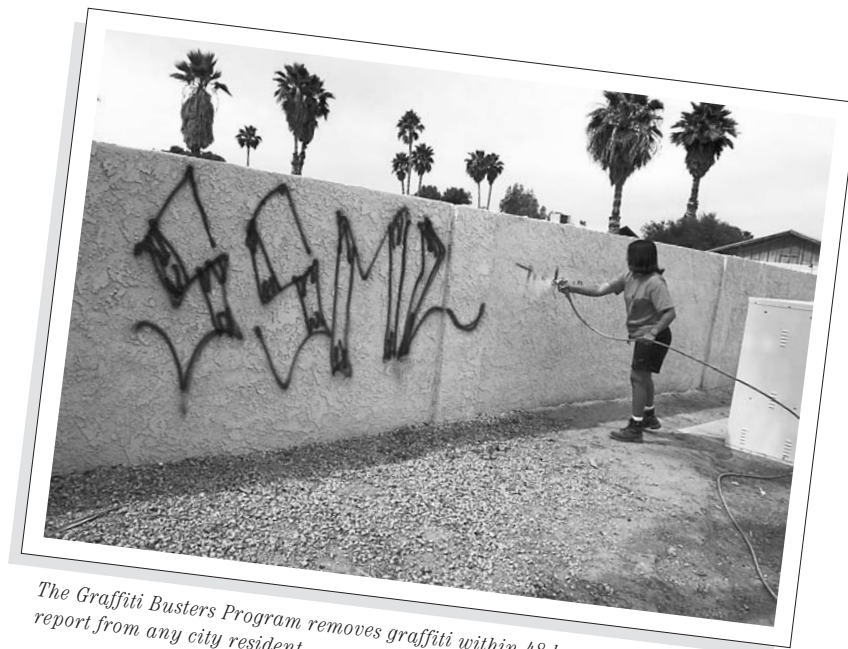
The Graffiti Busters Program removes graffiti within 48 hours of receiving a report from any city resident.