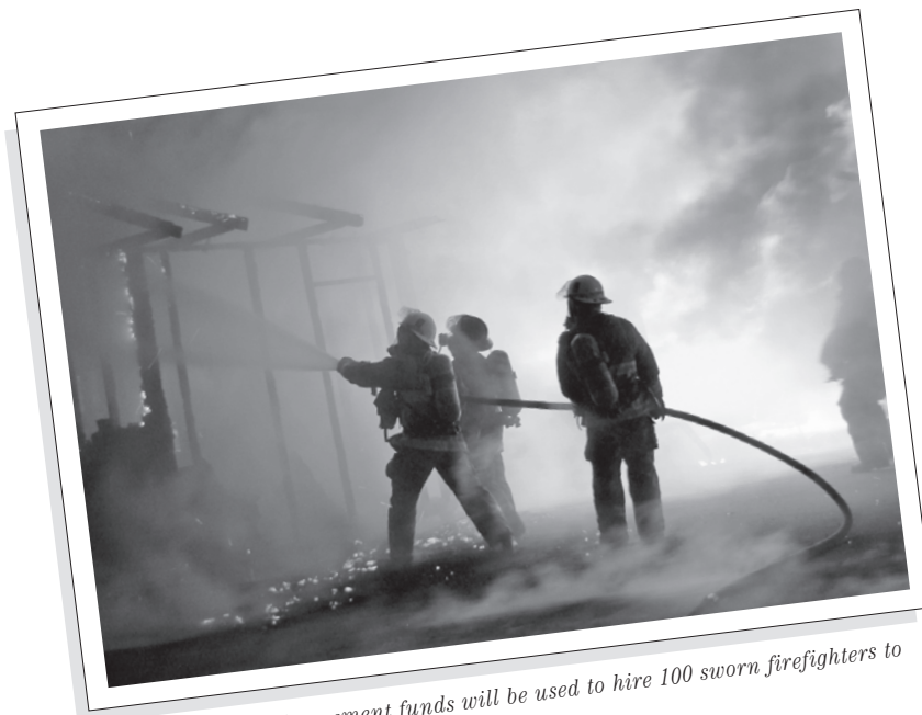
Public Safety Enhancement funds will be used to hire 100 sworn firefighters to improve fire protection services.