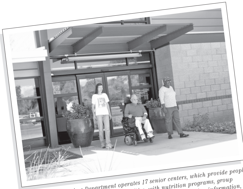
The Human Services Department operates 17 senior centers, which provide people, 60 years or older or adults with disabilities, with nutrition programs, group meals, educational opportunities, recreation and social activities, information, referral, advocacy, transportation and counseling/casework services.

The budget reductions will also eliminate senior home meal delivery carrying case replacement funding, eliminate a senior center volunteer recognition event and reduce contracted computer support. The Stay-in-School