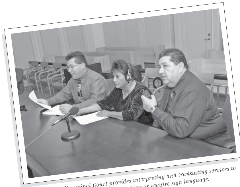
The Phoenix Municipal Court provides interpreting and translating services to individuals who are non-English speaking or require sign language.