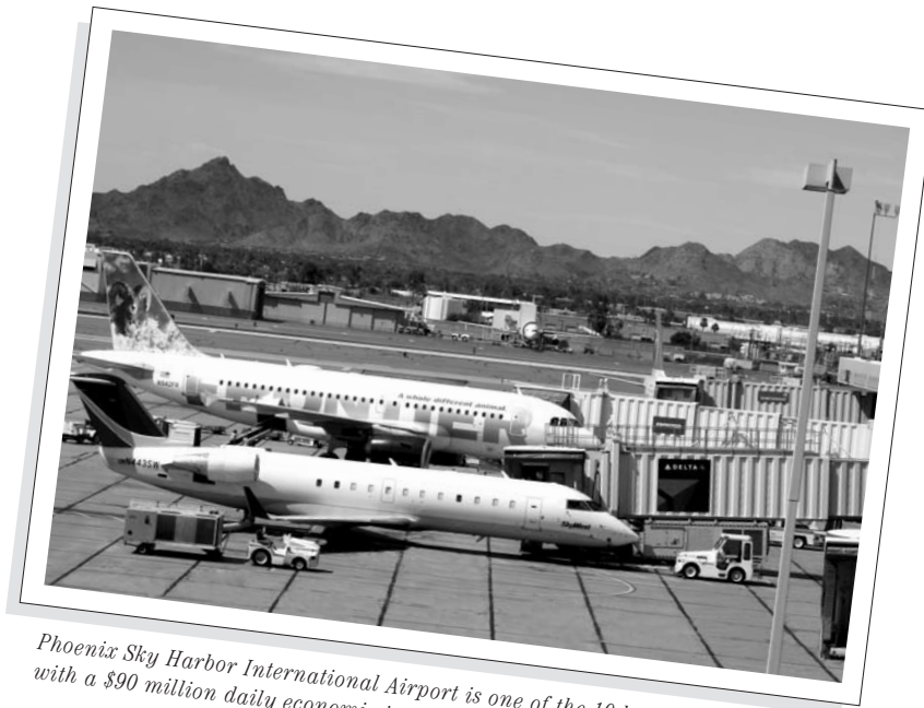
Phoenix Sky Harbor International Airport is one of the 10 busiest in the world with a $90 million daily economic impact.