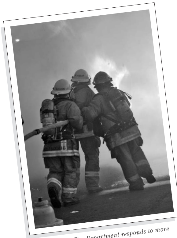
The Phoenix Fire Department responds to more than 14,000 fire-related calls each year.