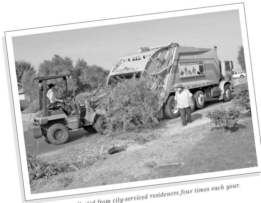
Bulk trash is collected from city-serviced residences four times each year.