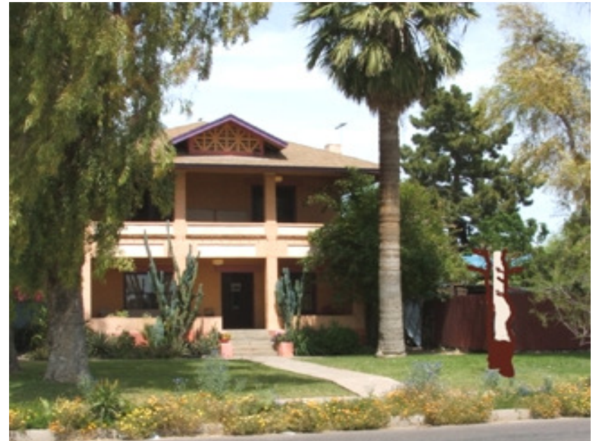
Alwun House- New sign installation & landscape improvements