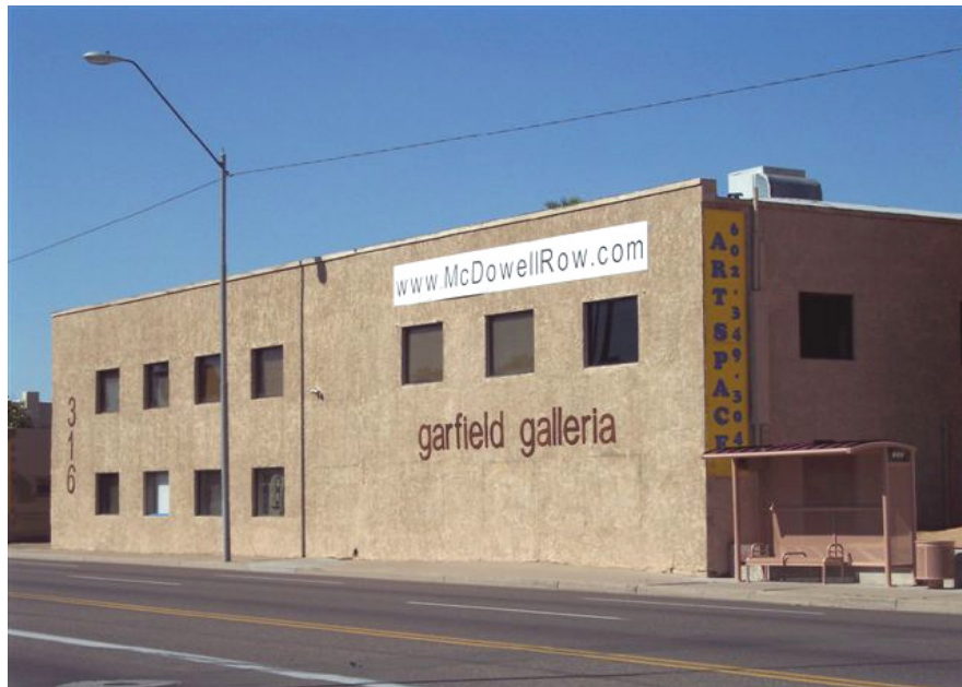
Garfield Galleria- facade improvements