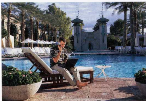
Work and play mix well in Phoenix's year round, sunny climate.