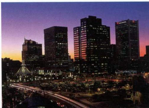
Copper Square, in the heart of downtown Phoenix.

1 Phoenix, AZ Rapid population growth means more customers and more workers, particularly for high-tech companies, while a renovated art museum, four major sports franchises, and the sunny climate attract residents.