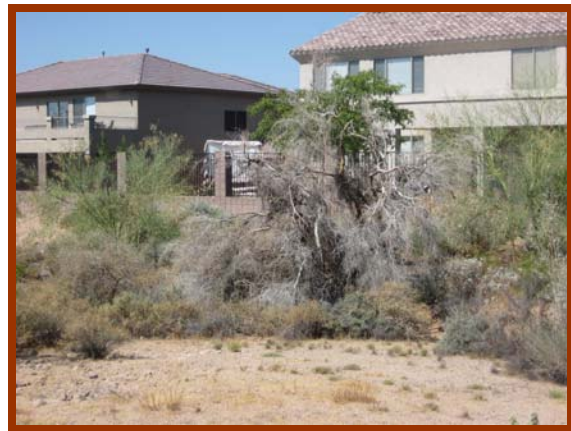
Dead vegetation should be retained to preserve the natural ecology.