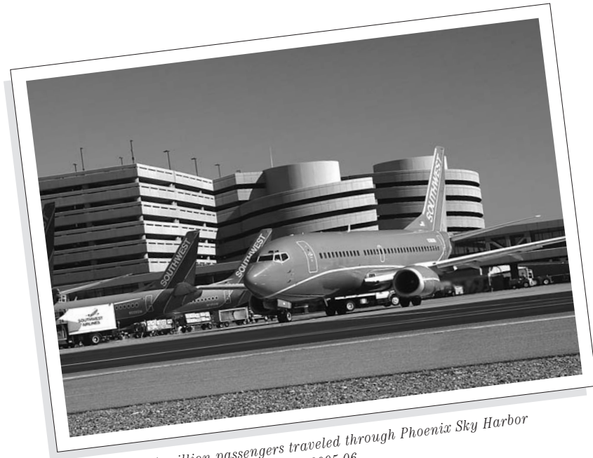
More than 41 million passengers traveled through Phoenix Sky Harbor International Airport in fiscal year 2005-06.