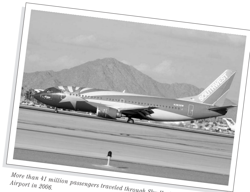
More than 41 million passengers traveled through Sky Harbor International Airport in 2006.