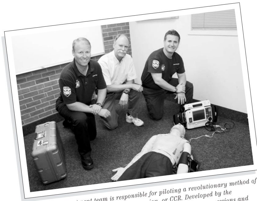
This Fire Department team is responsible for piloting a revolutionary method of CPR known as continuous chest compression, or CCR. Developed by the University of Arizona, the new technique emphasizes chest compressions and eliminates the need for mouth-to-mouth breathing.