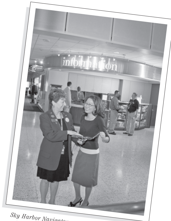
Sky Harbor Navigators are a group of friendly volunteers whose mission is to make traveling through Sky Harbor International Airport faster, easier and more enjoyable. Navigators provide directions, information and friendly assistance.