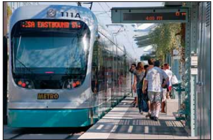
Ridership continues with great success.