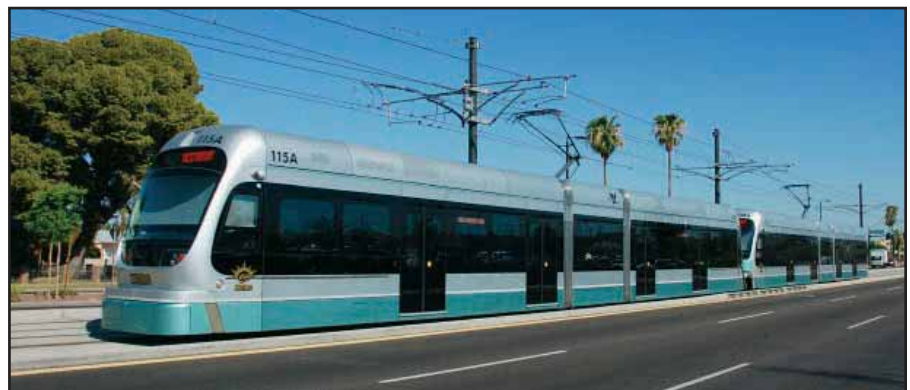
METRO light rail in service.

* Projects are not listed in any order of priority