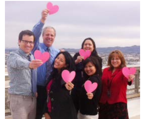
The city launched Instagram with an 'I Heart Phoenix' theme in February

For more information, call 602-262-4636 or visit phoenixpubliclibrary.org/hive .