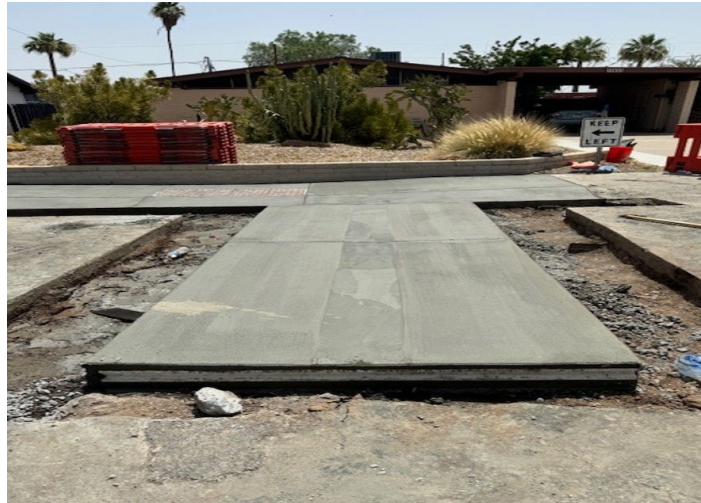
31ST AVE FROM ACOMA DR TO GREENWAY