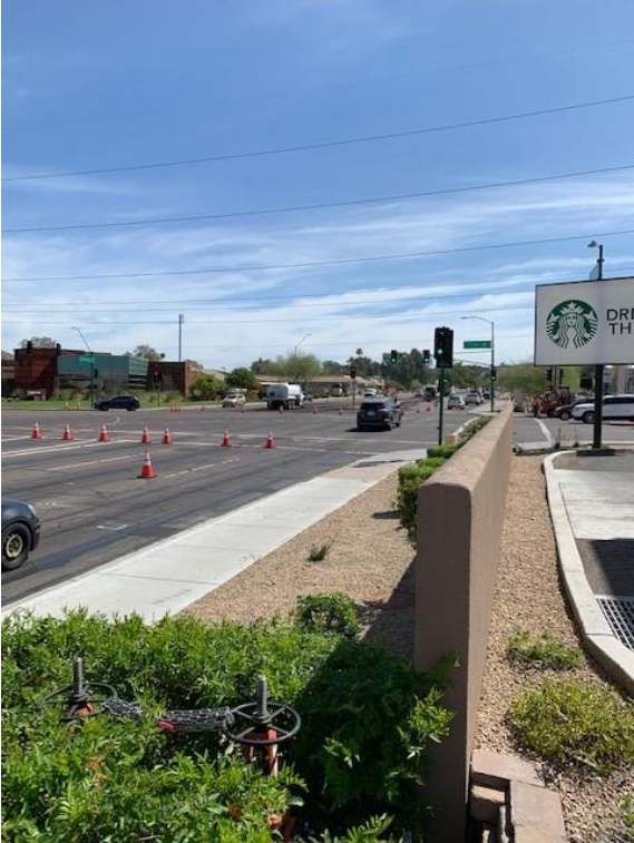
(Thunderbird east of 7 th St.)