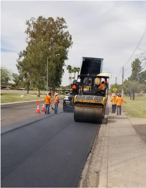
(Coral Gables from 7 th St. to 7 th Ave.)