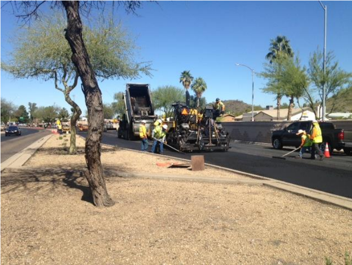
(Thunderbird Rd. between 19 th Ave. and Coral Gables)

Crews have been hard at work paving streets citywide. Thank you for your patience as we work to improve our roads.