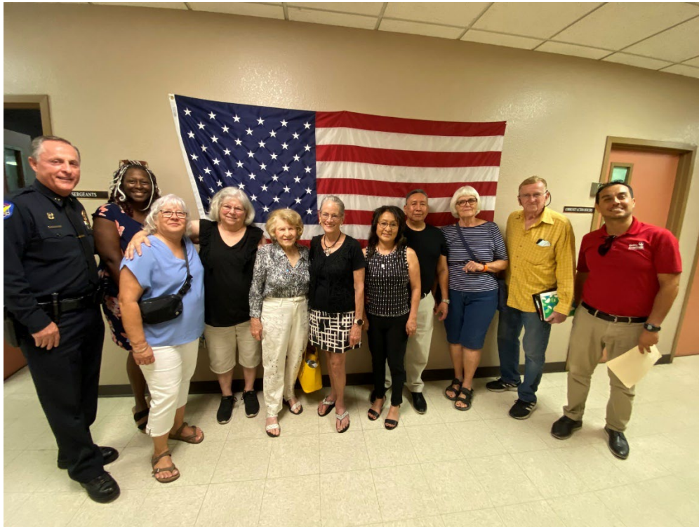
I-17 Corridor residents were happy to attend the ribbon-cutting ceremony.