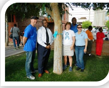
At the annual Blue Ribbon Ceremony to help raise foster care awareness