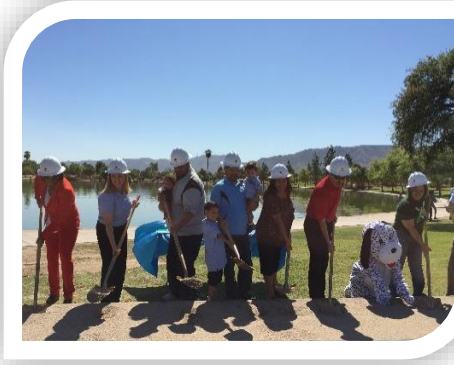
Cesar Chavez Dog Park Ground Breaking