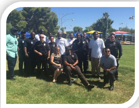
Hood2Hood Foundation Neighborhood Event