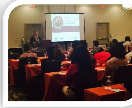
My Brother's Keeper Job Fair with Phoenix Sky Harbor International Airport