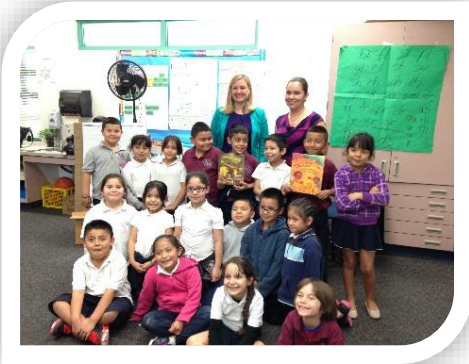
Celebrating the Mayors day of service