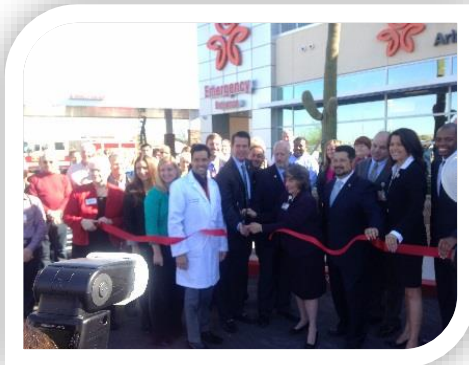
Celebrating the opening of Dignity Health; Laveen's first hospital