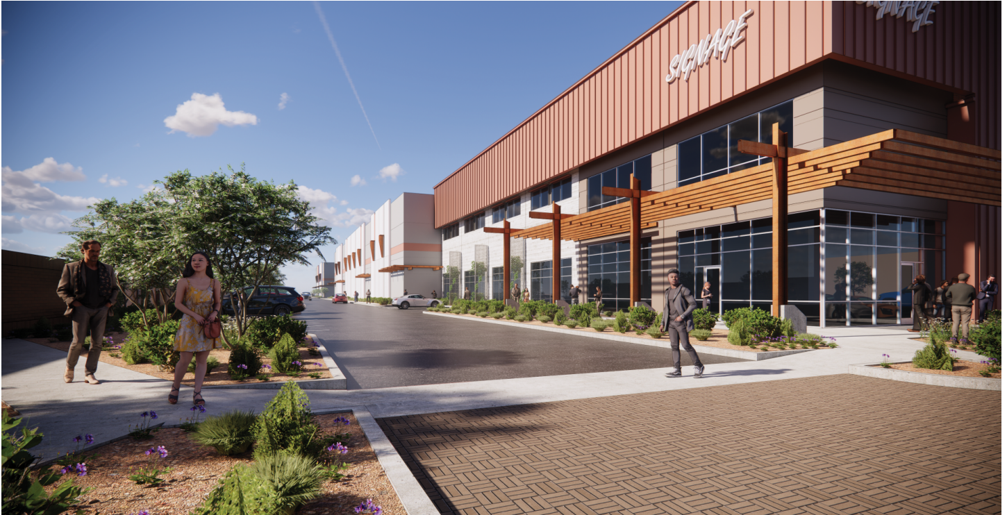
Building Character At South Elevation