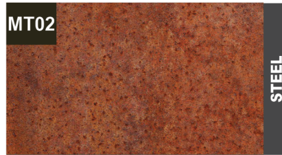
MT02 WEATHERED STEEL