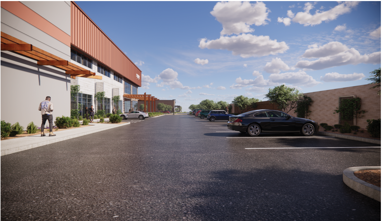
Privacy Garden Wall Example