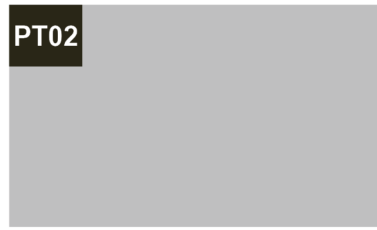
PT02 SILVER POLISH DE6374