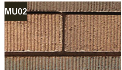
MU02 SEDONA RED Founder's Finish