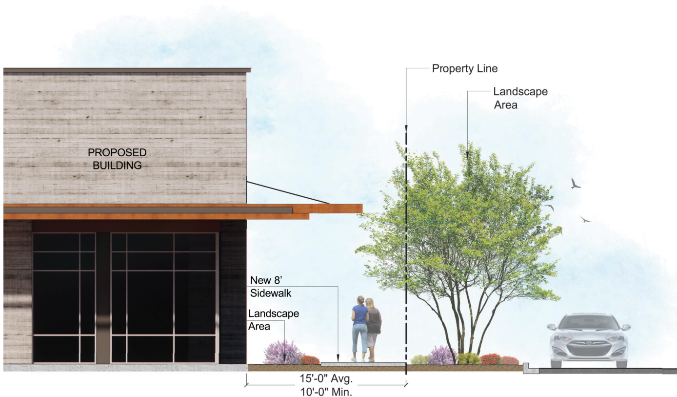
24th Street Section - N.T.S

To best demonstrate the enhancements and the improvement in appearance to adjacent properties, a proposed cross-section, privacy wall materials, and a rendering are shown below.