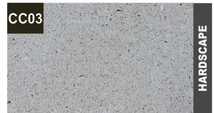
CC03 ACID ETCHED CONCRETE NATURAL GRAY