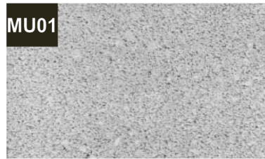
MU01 HUNTINGTON GRAY Precision Integral Color