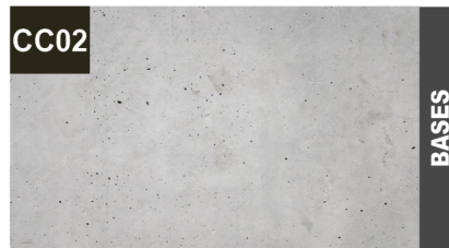
CC02 CAST-IN-PLACE CONCRETE NATURAL GRAY