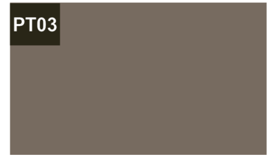
PT03 COCOA POWDER DET631