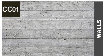
CC01 BOARD FORM CONCRETE NATURAL GRAY