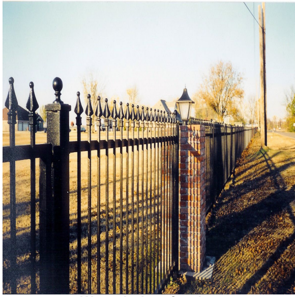
Wrought-iron fencing (Figure 4)

Per Zoning Ordinance Section 507 Tab A: Chain link fencing with plastic or metal slats, sheeting, nondecorative corrugated metal and fencing made or topped with razor, concertina, or barbed wire shall not be used where visible from public streets or adjacent residential areas. Alternatives exist, such as spiked or decorative wrought iron (see figure 4), high walls, and barrier type landscaping that can provide site security without contributing an adverse image to adjoining property.