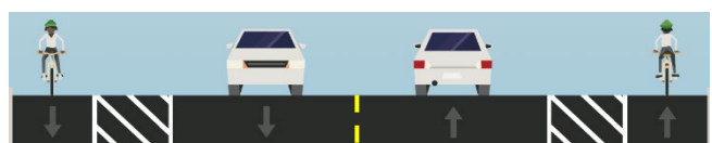
Proposed travel lanes