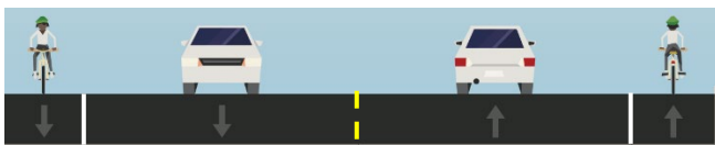
Current travel lanes