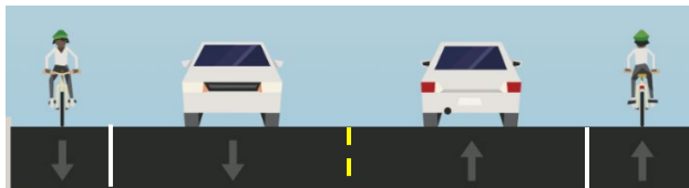
Current travel lanes