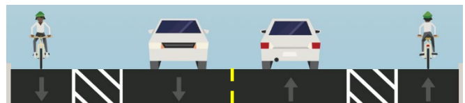
Proposed Travel Lanes