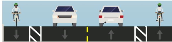
Proposed Travel Lanes