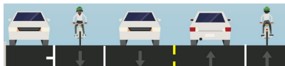
Proposed Travel Lanes