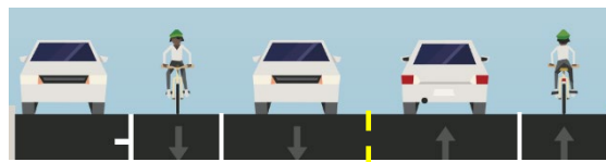
Current Travel Lanes (Parking allowed west side)