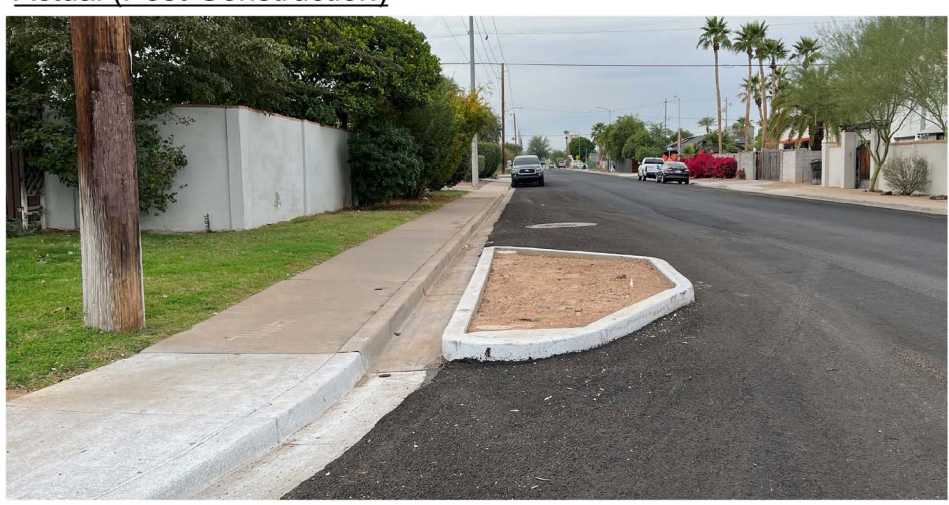
*Note - Landscaping not completed at time of photo