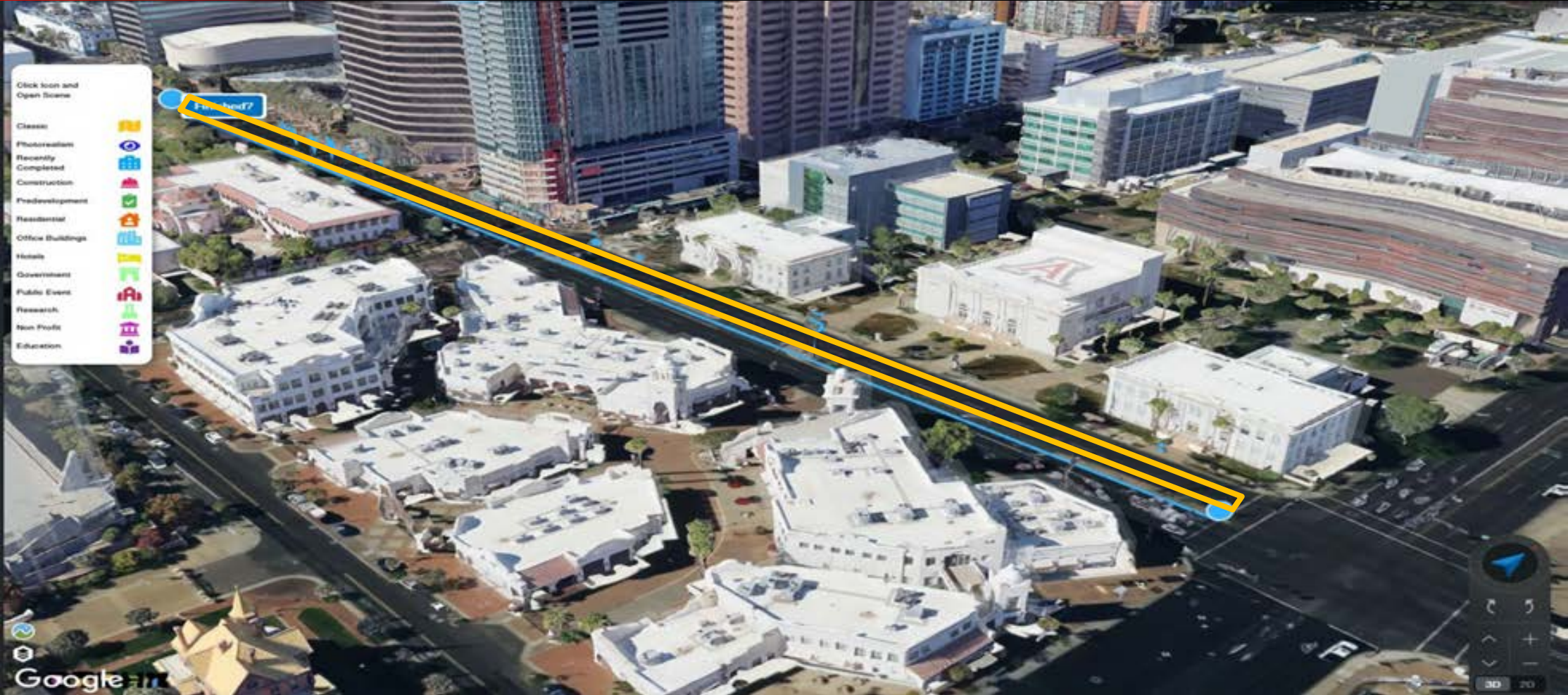
Van Buren Street between 2nd Street and 7th Streets